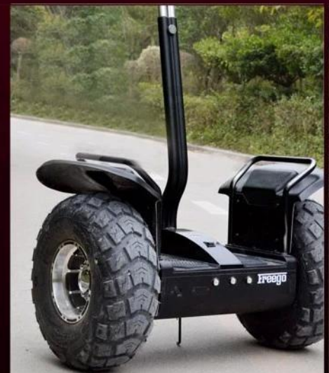
Keep the scooter remain level, then switch the power on.