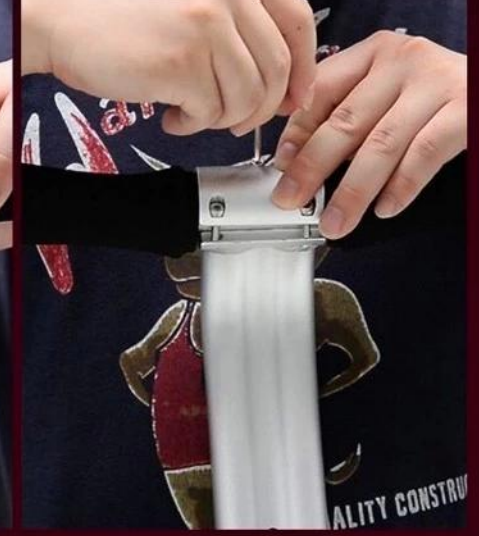
Put the clamp cover back, and fasten it with screws.