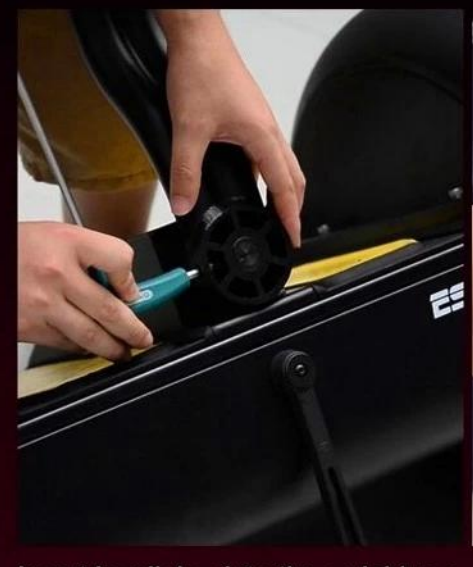
Insert handlebar into the padel base, then fasten the hexagon screws.