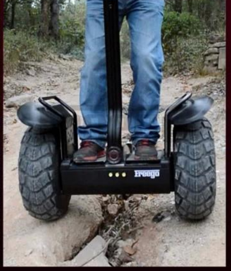
Hold the handle, and then step on the pedal one foot by one foot