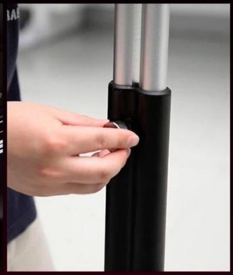
Adjust the height of the handlebar then fasten the adjusting screw.