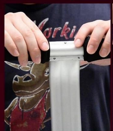
Remove the handle clamp cover, put two handles onto the connecting rod.