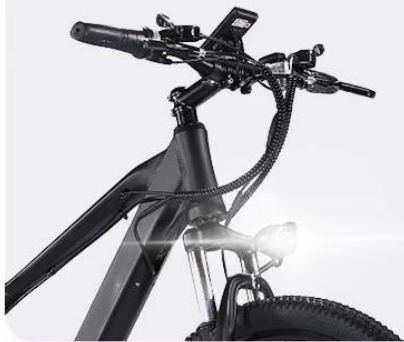
LED Circular Headlight