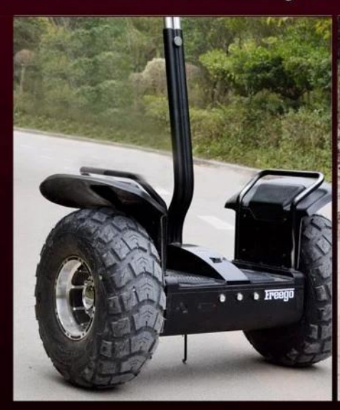
Keep the scooter remain level, then switch the power on.

Put the clamp cover back, and fasten it with screws.